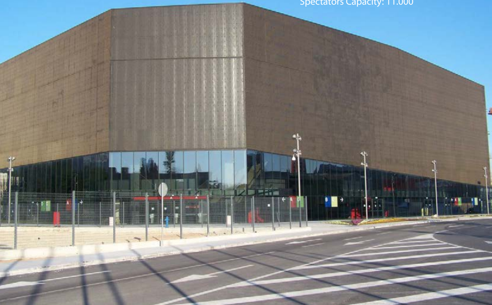
Spaladium Arena Spectators Capacity: 11.000