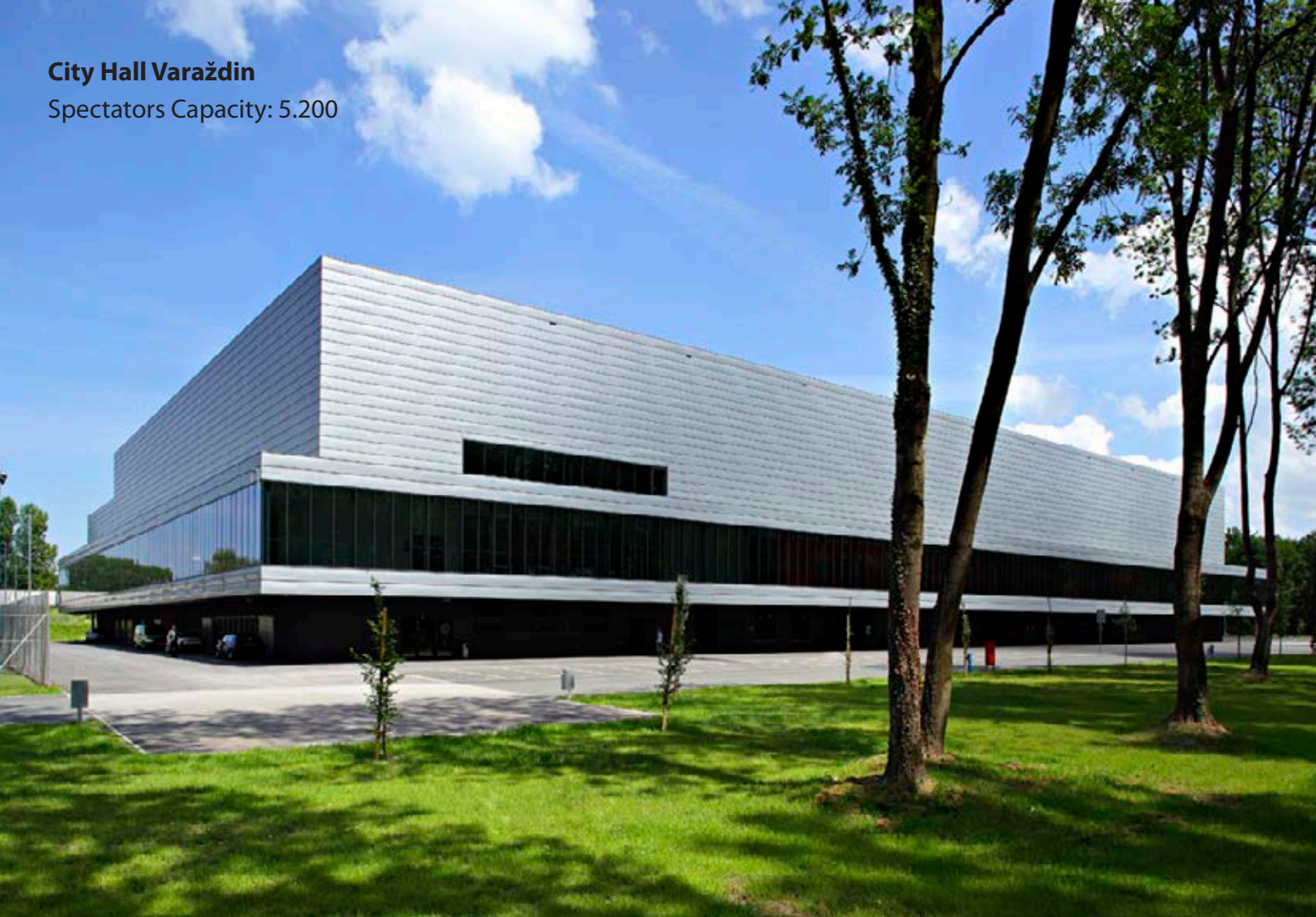
City Hall Varaždin Spectators Capacity: 5.200